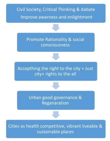
Fig. 1. Diagram 1: Conceptual framework of subject

The cities are going to be creative and vary creativities take place in them; but in order to having such specifics, they also require spaces for their realization and formation the civil society. During resent process, public spaces are the best places for realize new ideas and innovations. These have always been where people start. On the other hand, the city may become a crucible critical place of thoughtful ideas. Urban geography study these special places as the points of start changes. What citizens need or seek them at the time. These changes may calling "regeneration". Given that this changes require deep attitude to humanity and happiness. Meanwhile it needs critical thinking and debate that improve social awareness and then civil enlighten.