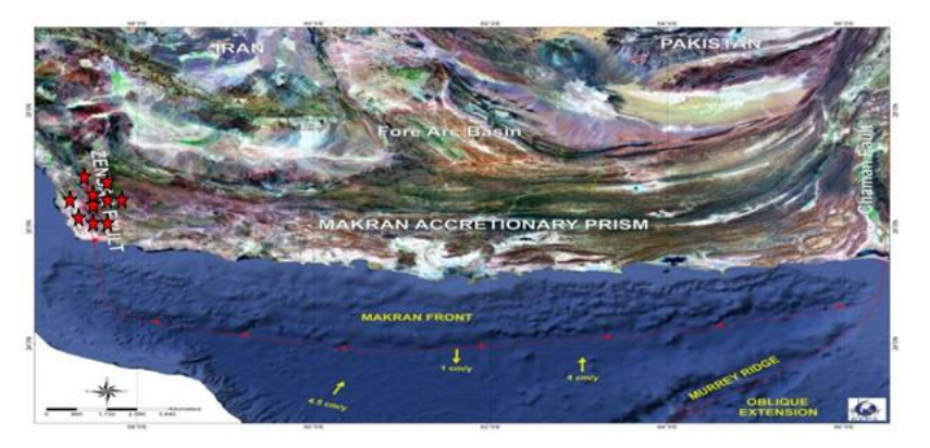
Fig. 1. ETM image of the Makran accretionary wedge and area showing positions of mud volcanoes.

MVs. One of the most active examples is located 15 km far from the village of Gatan and less than 30 km far from the coastline of the Makran Sea (Fig. 2). In this paper we intent to introduce newly mud volcano complex. These mud volcanoes are in south east of Iran near the zendan fault. This complex includes more than 20 MVs. The relative heights that mud volcanoes reach vary from a few centimeters up to 40 m. In plain view, they are isometric or slightly elongated with craters up to 30 m in diameter, and 2-3 km across the base. Some of the MVs are spaced very close to each other, forming a common body and the flows of MV breccias cover areas of 30km<sup>2</sup> or more.