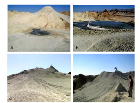
Fig. 4. Iimages and field photographs showing mud volcanoes morphology

Result of ICP-OES analysis were show in the table (1, 2). Some elements such as Ag are less than detection limite of instrument.