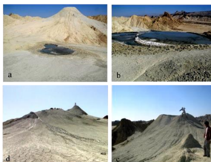
Fig. 4. Images and field photographs showing mud volcanoes morphology

Result of ICP-OES analysis were show in the table (1, 2). Some elements such as Ag are less than detection limite of instrument.